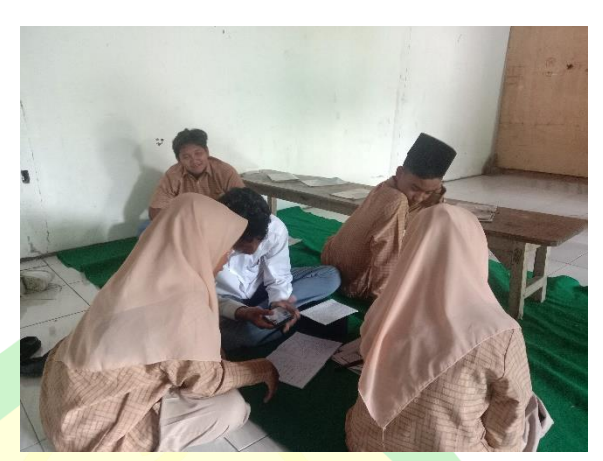
Figure 4.1. Students actively discuss the tasks given by the teacher

Then, the last activity is the closing activity, which is the final part of the learning process. Following are the closing activities in implementing the discussion method in English lessons, namely: the teacher asks students to conclude the material that has been studied, provides reinforcement of the material that has been studied, conveys the material that will be studied next, closes the lesson by saying hamdalah , and greets the participants. Learning from the day's observations ended at 10.10 WIB.